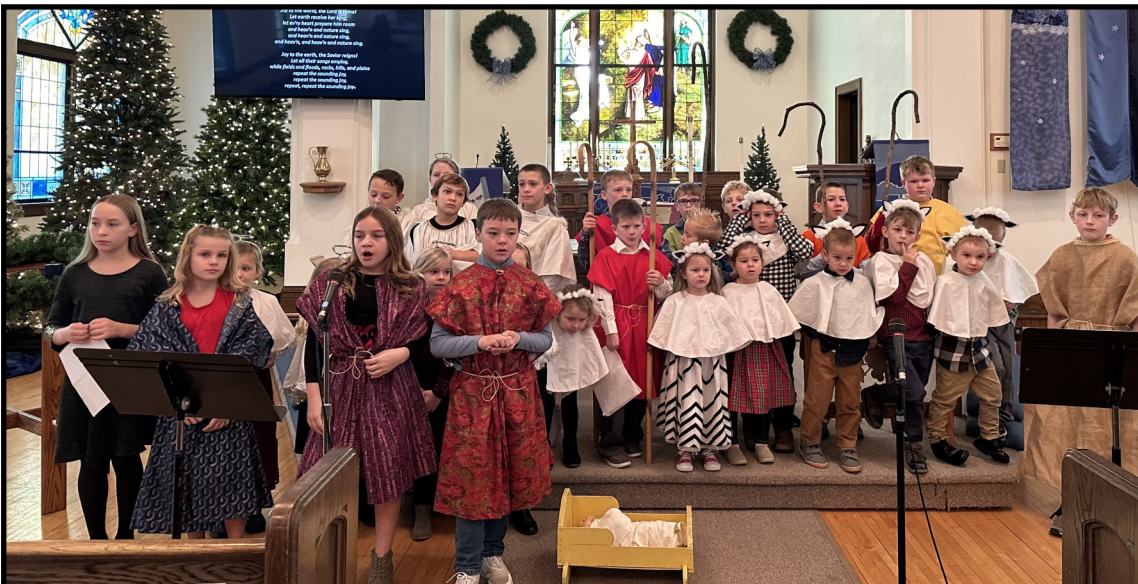
Thank you to the Sunday school students and their teachers for the wonderful Christmas Program "Room at the Inn" they presented on Sunday, December 17th.